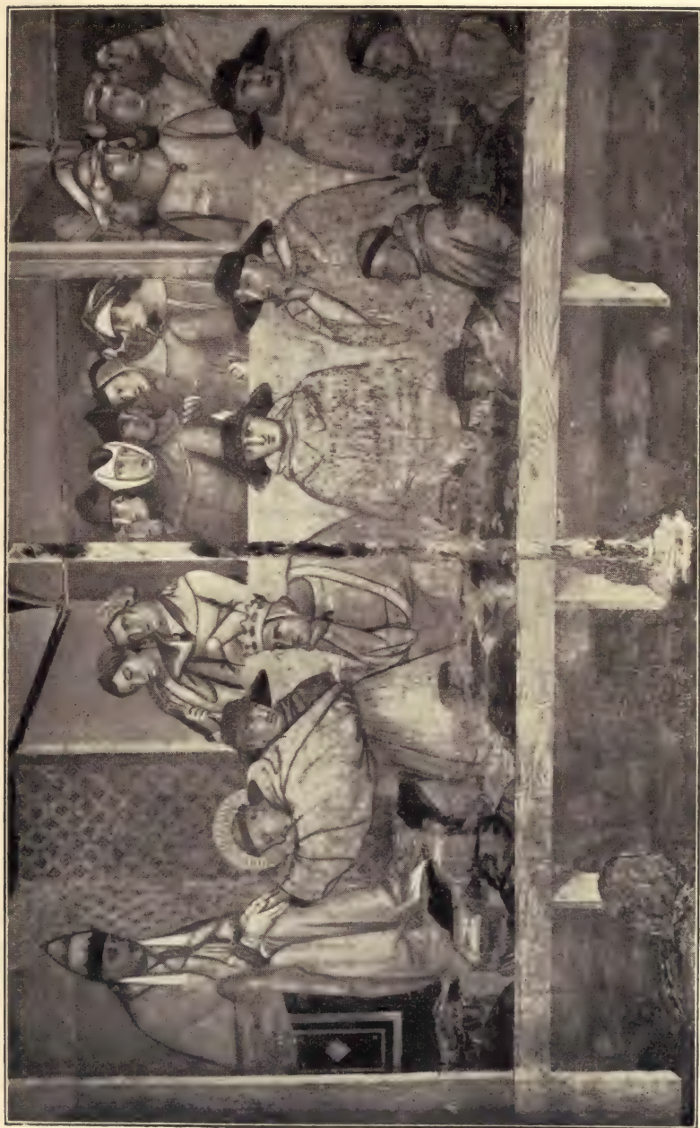
BONIFACE VIII RECEIVING ST. LOUIS OF TOULOUSE, SON OF CHARLES MARTEL, KING OF NAPLES.