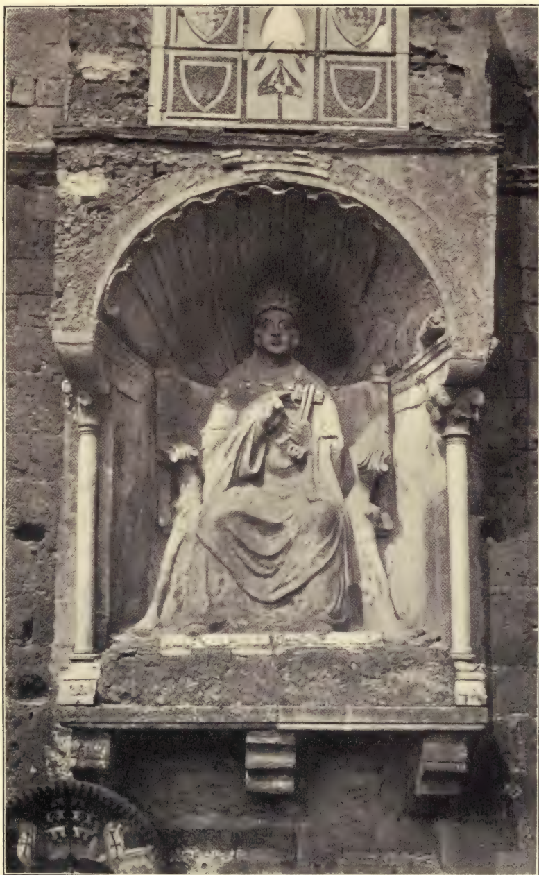
STATUE OF BONIFACE VIII, SET IN THE FACADE OF THE CATHEDRAL OF ANAGNI.