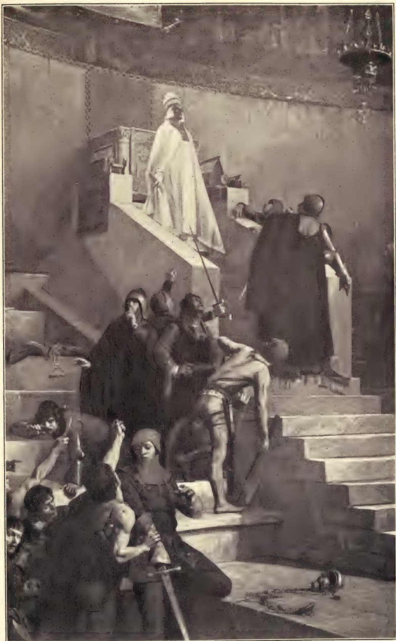
THE OUTRAGE AT ANAGNI, BONIFACE VIII AND HIS ASSAILANTS.