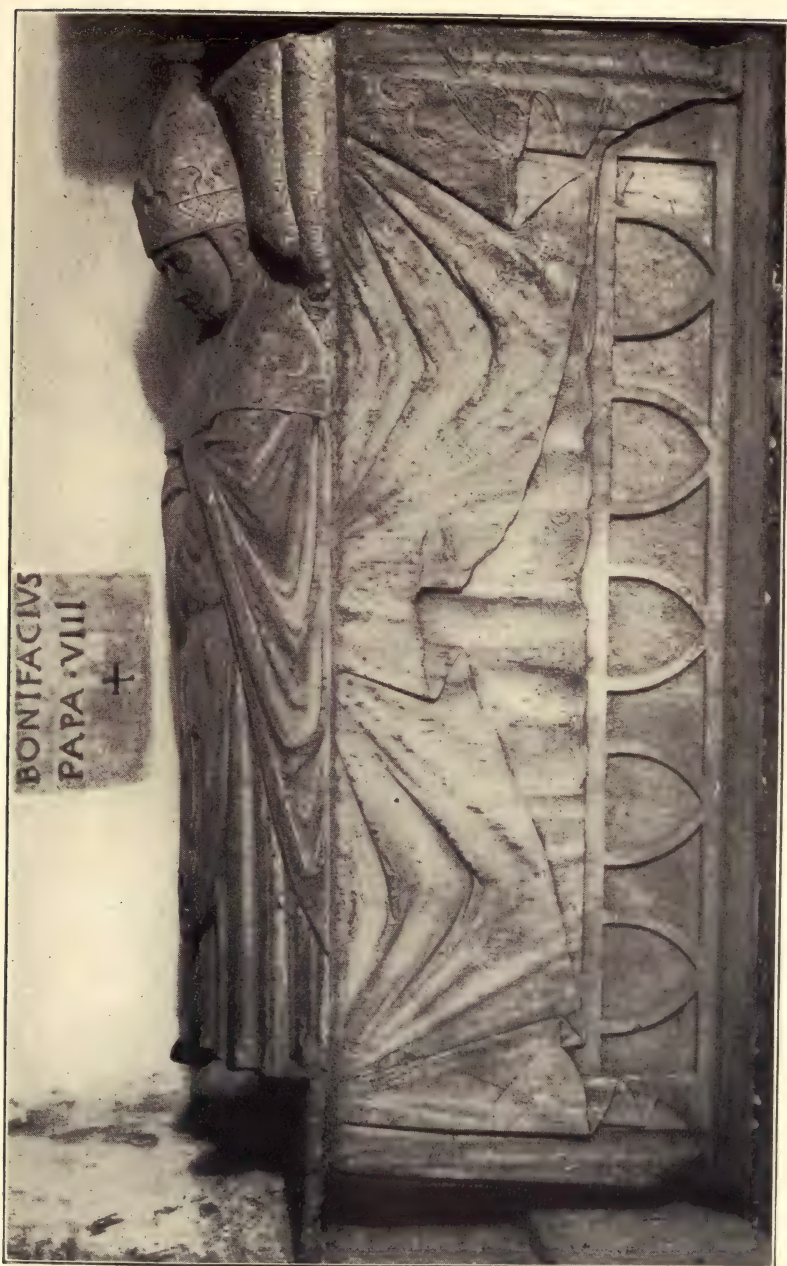
TOMB OF BONIFACE VIII IN THE CRYPT OF ST. PETER'S.