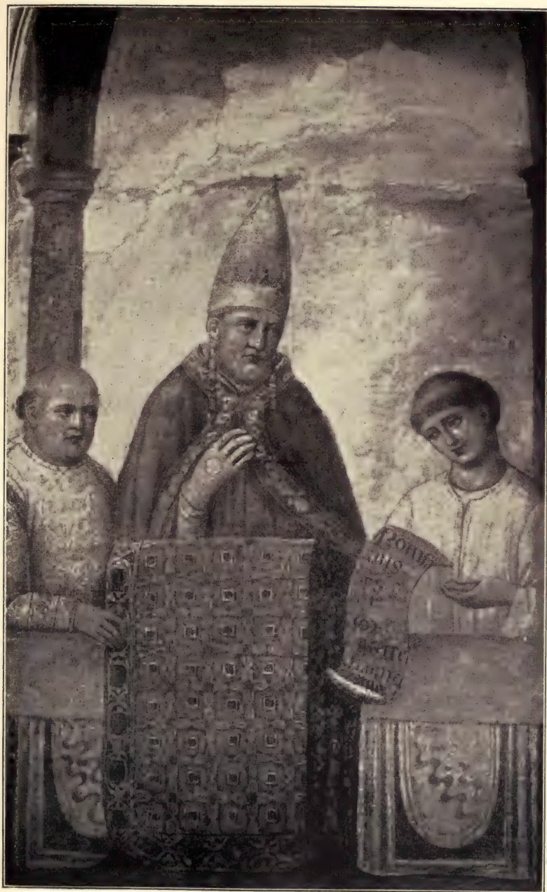
BONIFACE VIII PROCLAIMING THE JUBILEE.