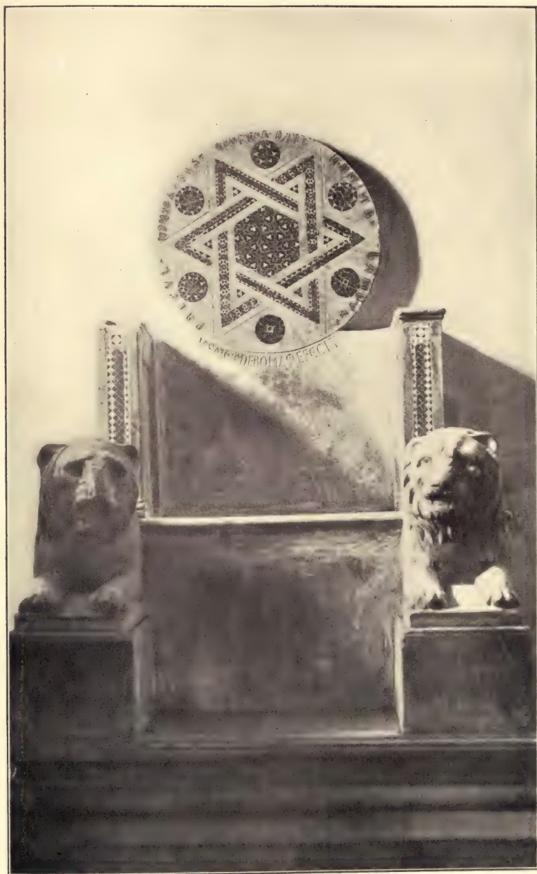
EPISCOPAL CHAIR IN THE CATHEDRAL OF ANAGNI.