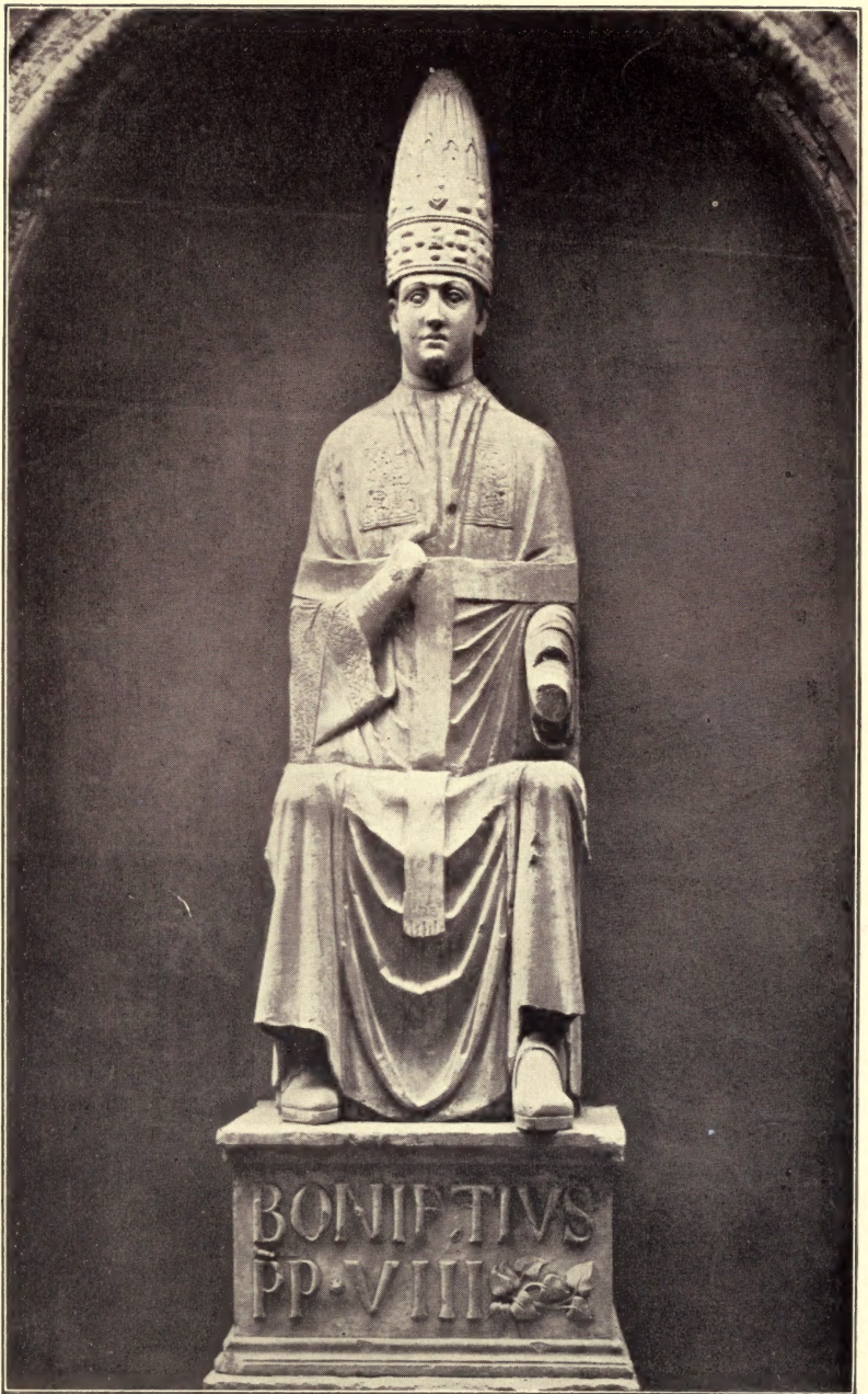
STATUE OF BONIFACE VIII, IN THE CATHEDRAL, FLORENCE.